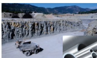
Geology, Cement, Mining